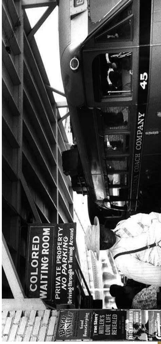
Alayna & Balla

The Codes appeared throughout the south as a legal way to put black citizens into indentured servitude, to take voting rights away to put black citizens into indentured servitude, to take voting rights away, to control where they traveled and to seize children for labor purpose. In essence keeping them in slavery without it being “slavery”.